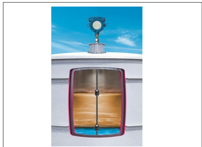
Fig. 2: Example of product and interface level measurement